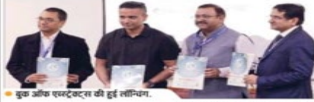
● बुक ऑफ एब्स्ट्रेक्ट्स की हुई लॉन्चिंग.