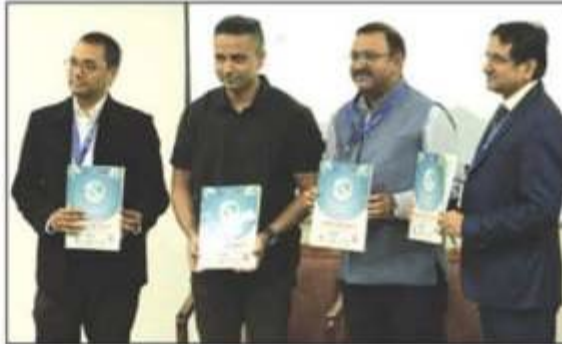
Dignitaries pose for group photograph.

He also underscored the critical role that innovation and research play in addressing environmen-