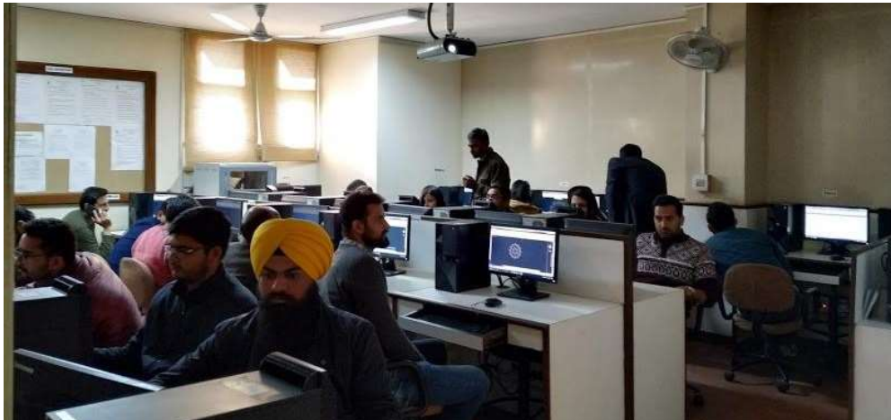
Training Session at CAD Lab