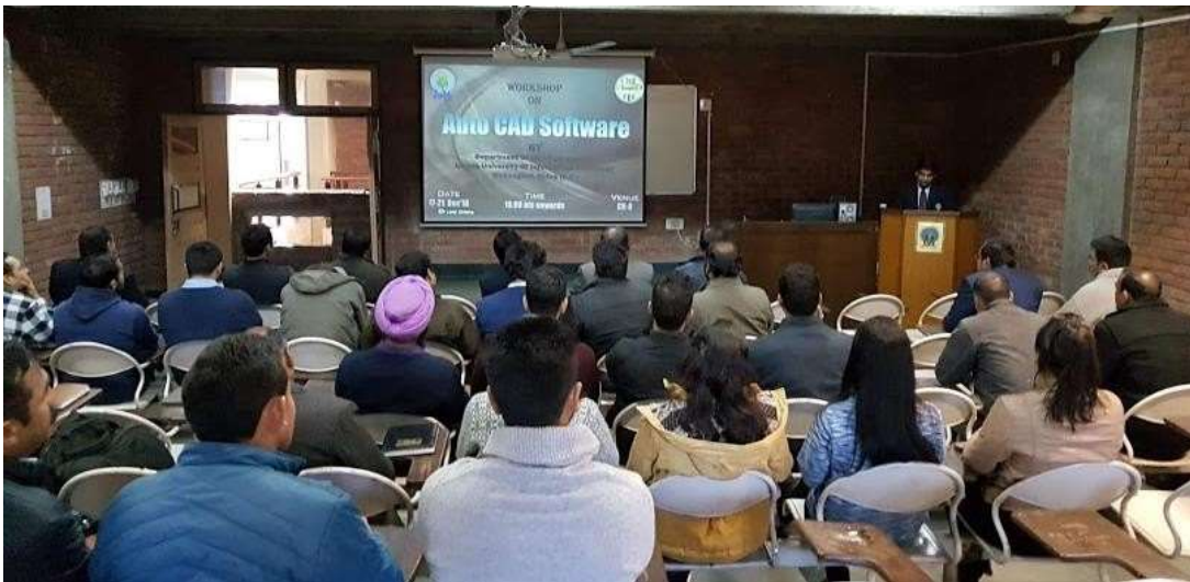
Welcome Speech by Student Coordinator