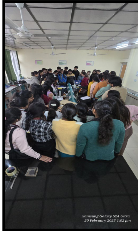
Samsung Galaxy S24 Ultra 20 February 2025 1:02 pm