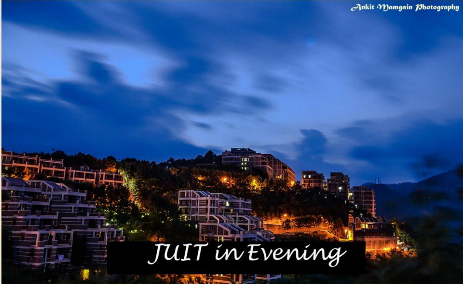
JUIT in Evening