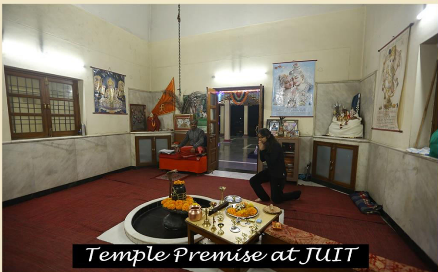
Temple Premise at JUIT