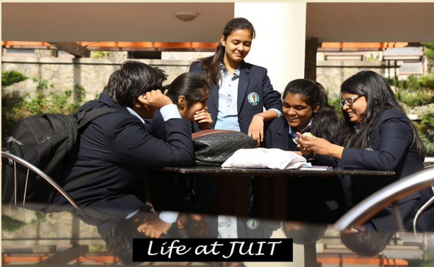
Life at JUIT