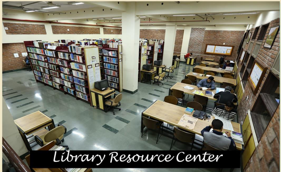
Library Resource Center