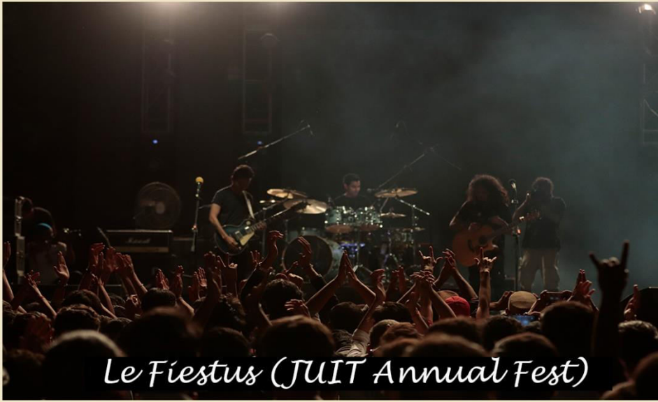
Le Fiestus (JUIT Annual Fest)