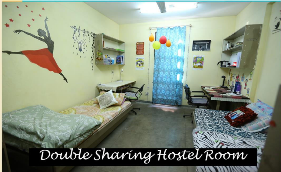
Double Sharing Hostel Room