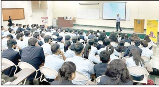
Students attending 'Future Business Sharks 2.0' at Japee University.